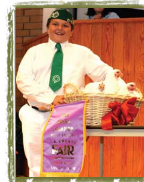
4-H member and his award-winning chickens

California's agricultural heritage by pairing 4-H members, Future Farmers of America, college students and other agriculture students with local businesses and individuals who are eager to support the program and purchase quality livestock. The auction is the culmination of a yearlong effort by students to learn the business of purchasing, raising and preparing livestock for sale. When the bidding is over, future farmers and ranchers have had an opportunity to recoup their financial investment and earn awards for prize-winning livestock.