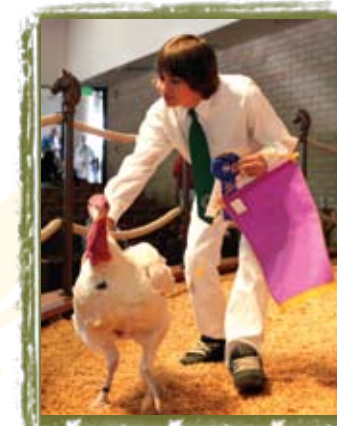
Junior Livestock Auction award-winning turkey

Presented by the Fairplex Education Foundation, the Junior Livestock Auction supports and promotes