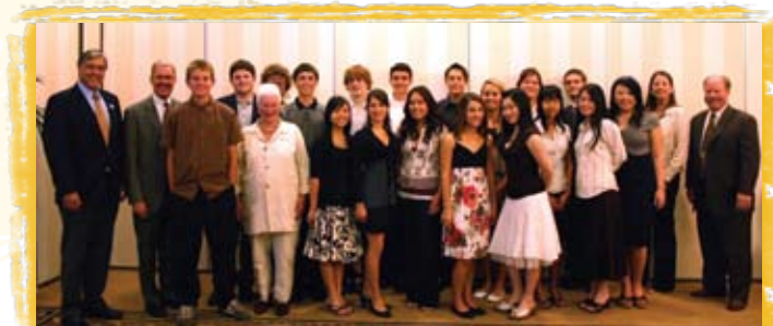
Junior Fair Board and Los Angeles County Fair Association members