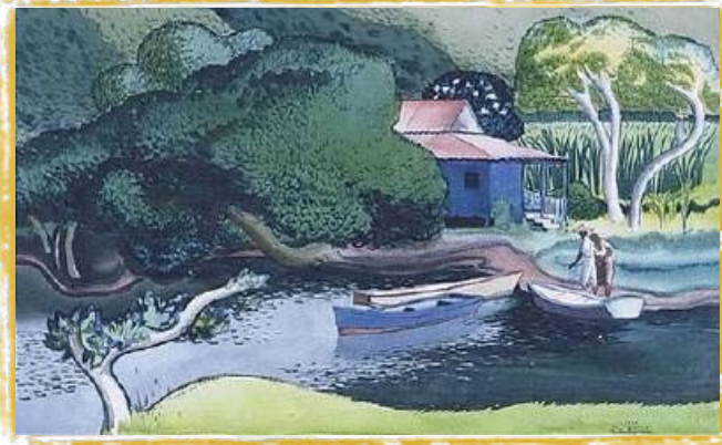
Millard Sheets' Kahana Bay

This year the newly christened Millard Sheets Center for the Arts at Fairplex (MSCA) celebrates the 100th anniversary of the birth of the center's namesake, noted artist, designer and educator Millard Sheets (1907-1989). Sheets played a pivotal role as director of the Fine Arts Exhibition at the L.A. County Fair from 1931 to 1956.