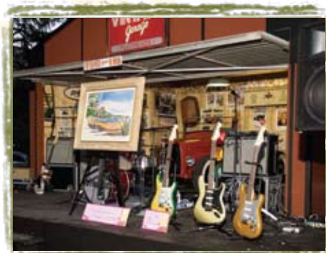
Wine & Cars live auction items

Unveiled at the event were the best-of-show wine, Silver Stone Wines' Tempranillo, Paso Robles, 2004; the best tequila, El Tesoro de Don Felipe; and the seven best extra virgin olive oils: best extra virgin olive oil – domestic delicate, Savor Extra Virgin Olive Oil, Arbequina, Central Coast; best extra virgin olive oil – domestic medium, Clos Pepe Estate, Central Coast Blends, Santa Rita Hills; best extra virgin olive oil – domestic robust, Pasolivo, Central Coast Blends, Paso Robles; best extra virgin olive oil – international delicate, Mas Des Bories Salon de Provence, France; best extra virgin olive oil – international medium, Oleo De La Marchia Central Italy, Ancona, Marche; best extra virgin olive oil – international robust, Frantoi Celletti & Cultivar – Bosana Italy, Islands, Sardegna; and best flavored olive oil, Pasolivo, Tangerine.