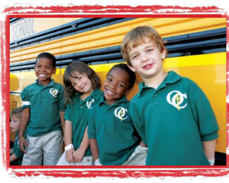
Children fresh off the bus, eagerly awaiting their day at the Fair.